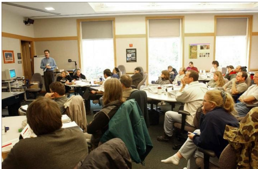
Training in action